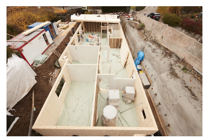
Basement during the construction phase