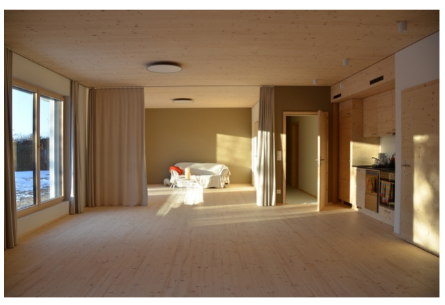
Interior view of the basement